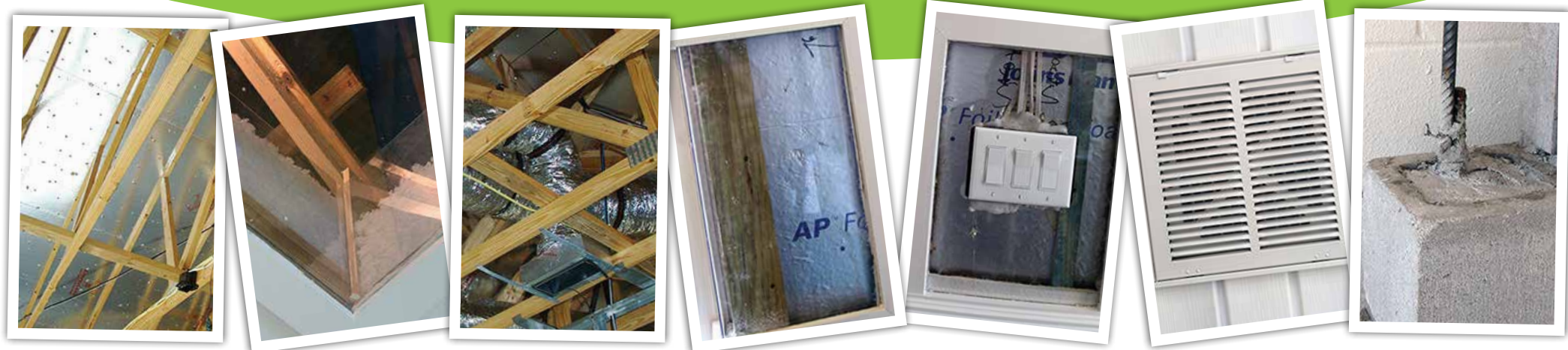
Reflective Radiant Barrier Reflective radiant barrier on roof sheathing for maximum sun and heat protection. R-30 Blown Insulation R-30 blown insulation helps reduce energy costs. A/C Hanging Strap Air conditioning supply line hanging straps keeps ducts off bottom truss cords and help to ensure proper air flow. Insulated Exterior Walls 3/4" rigid foam board insulation on exterior walls to reduce noise and improve energy efficiency. Insulated Electrical Outlets Exterior walls insulated with foam around electrical outlets to prevent moisture and air intrusion. Fresh Air Intake Fresh air intake for whole house fresh air exchange for improved air quality throughout house. Reinforced Concrete Block Steel reinforced concrete construction block cells filled with 3000 PSI concrete around steel.

It pays to know BEFORE you buy! Increasing numbers of Energy Smart builders are having their homes energy rated. If the home you want to buy doesn't have a HERS® Index rating - ask for it. The U.S. Department of Energy has determined that a typical resale home scores 130 on the HERS® Index. The LOWER the HERS® Index the more energy efficient a home is, meaning lower energy costs for the homeowner. A low HERS® Index adds VALUE and COMFORT to a home, which is why builders across the United States ensure that all their homes are energy rated.