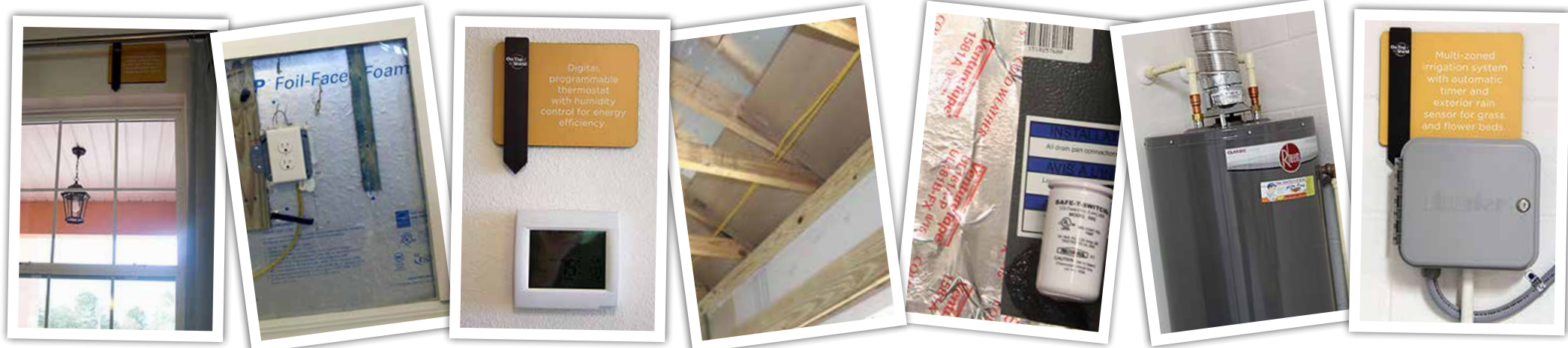
Low-E Glass Windows Low-E glass insulated double pane, single hung, argon gas filled, vinyl framed windows to reduce utility costs. Treated Furring Strips 1" x 2" pressure treated furring strips enhance insulation value for reduced utility bills. Programmable Thermostat Digital programmable thermostat with humidity control for energy efficiency. Insulation Baffles Baffles prevent insulation from restricting air movement reducing utility costs. 15 SEER A/C System 15 SEER A/C system with condensate overflow safety switch to avoid water damage and PVC fresh air intake and exhaust to exterior. 40 Gallon Gas Water Heater 40 gallon natural gas water heater. Multi-Zoned Irrigation Multi-zoned irrigation system with automatic timer and exterior rain sensor for grass and flower beds.

These are a few of the ENERGY-SAVING construction FEATURES INCLUDED in your new home to save you more money every month.